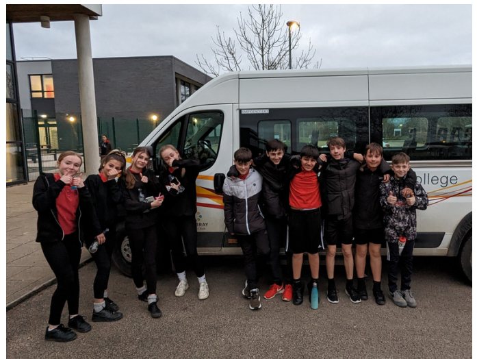
Pictured below: John Ferneley College Year 8 Athletics Teams