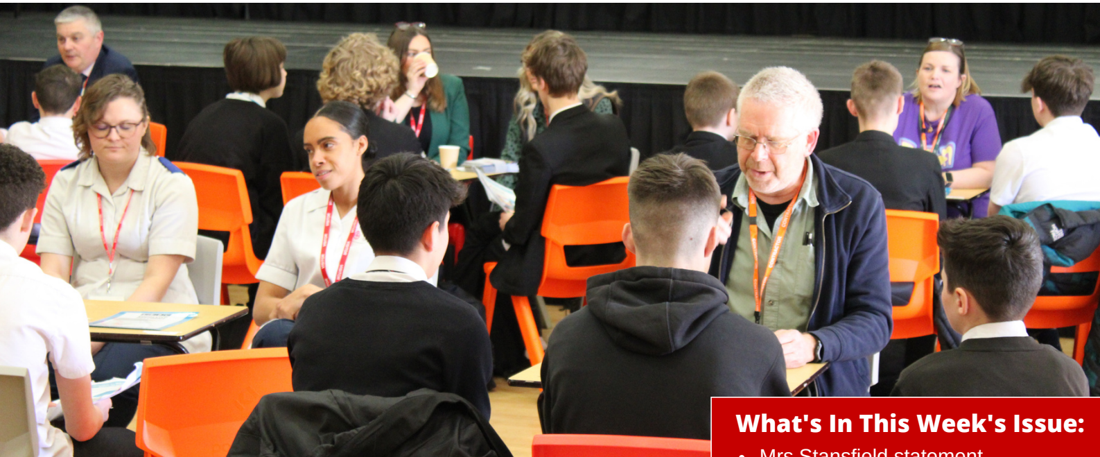
Year 10 students attending the Careers Fair on Tuesday 14th March