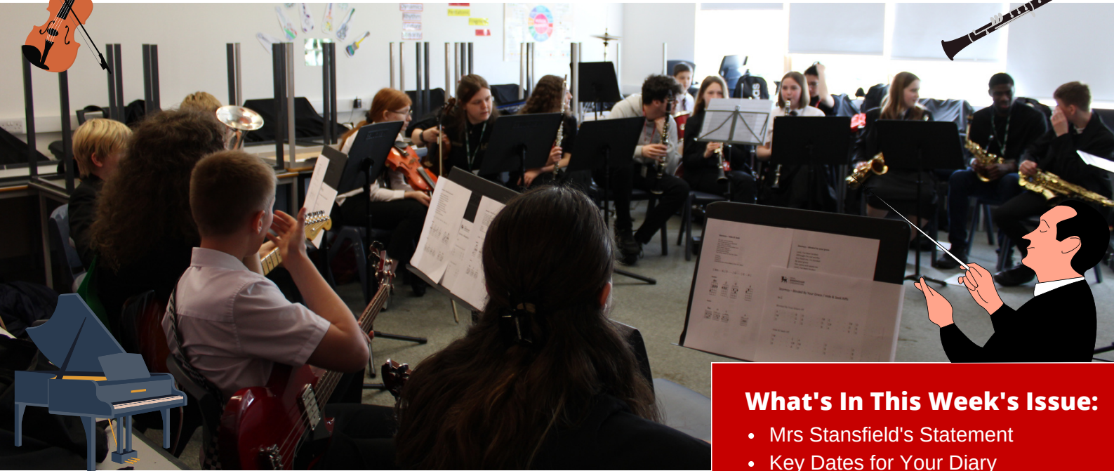
RBC and JFC musicians rehearsing together at school this week!