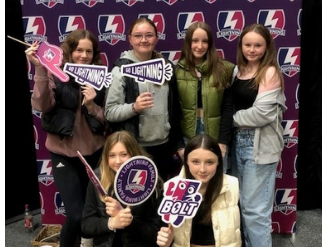
Pictured above: JFC students excited to be watching the match