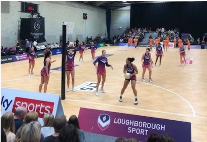
Pictured above: Loughborough Lightning on the court