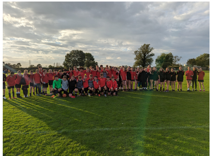
Pictured above: JFC KS3 Football Teams