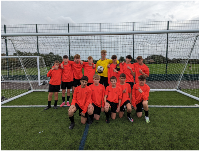
Pictured above: JFC Year 10 Boys' Football Team