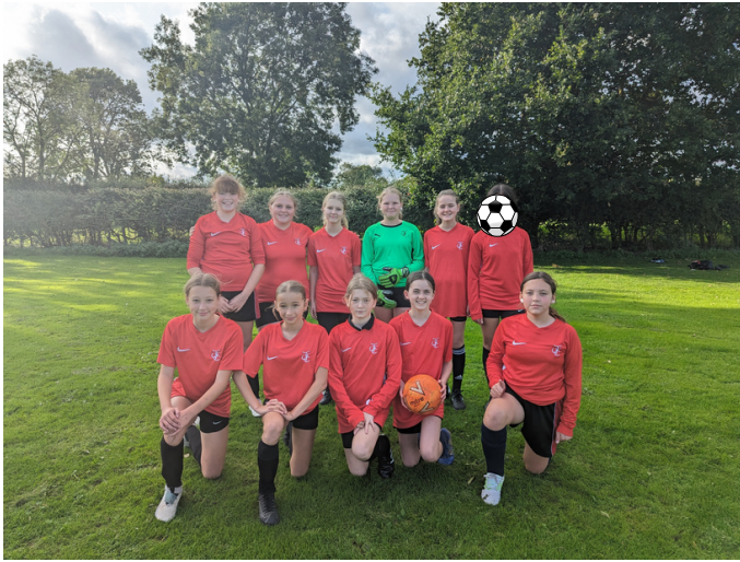
Pictured above: JFC Year 7 Girls' Football Team