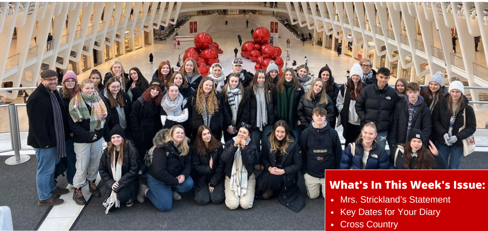
Students on the New York Trip!