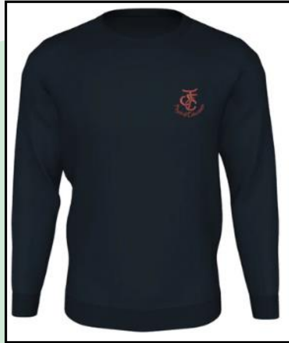
Plain black or school logo jumper