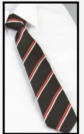
Optional tie and blazer