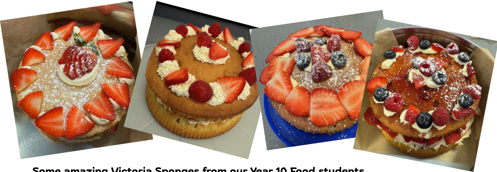
Some amazing Victoria Sponges from our Year 10 Food students